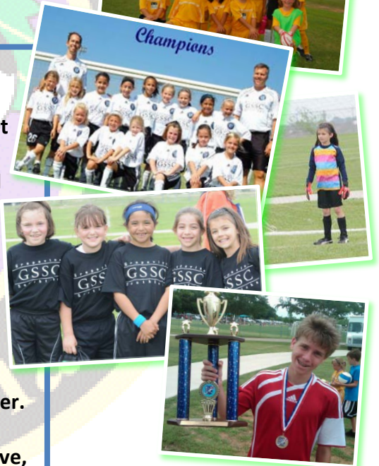
SoccerFest takes place at four soccer complexes...